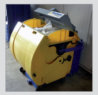
Rubbish container press

The rubbish bin press can be flexibly used for different kinds and sizes of bins. Machine equipment depends on the bin size.