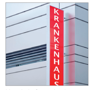
Hospitals & nursing homes